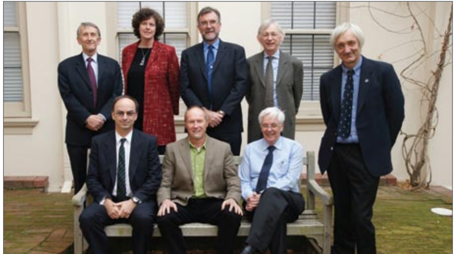
Members of the National Committee for Antarctic Research