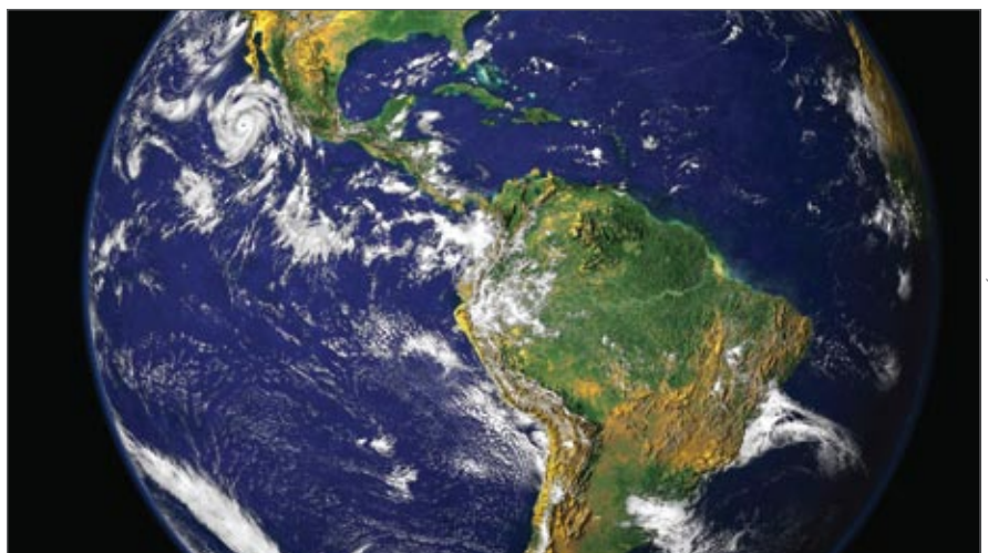
Earth observation: On the agenda for space science

More information on the draft Decadal Plan for Australian Space Science can be found at www.physics.usyd.edu.au/~ncss/