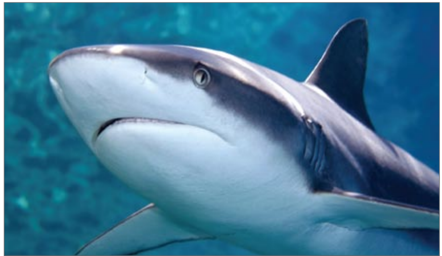
Alternative ageing method still needed for sharks and relatives

Six species were used: the Port Jackson shark; piked spur-dog; southern fiddler ray; sparsely spotted stingaree; thornback skate; and the elephant shark. Telomeres were also measured in a species of teleost