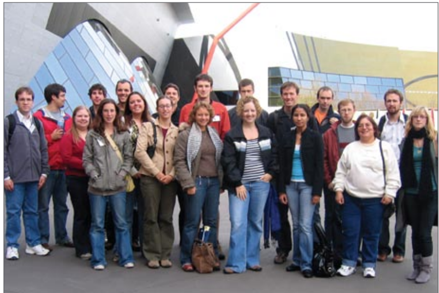
Graduate students from the USA participating in the summer program