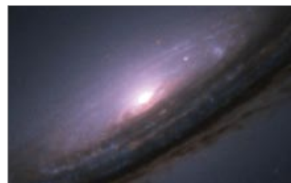
Exploding star: Clues to an accelerating universe