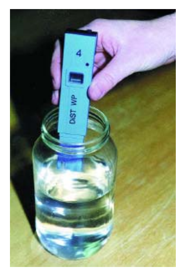
Figure 2. Measuring electrical conductivity with a hand-held meter.

Seek the advice of a reputable supplier of scientific equipment who will advise which meter best suits your requirements.