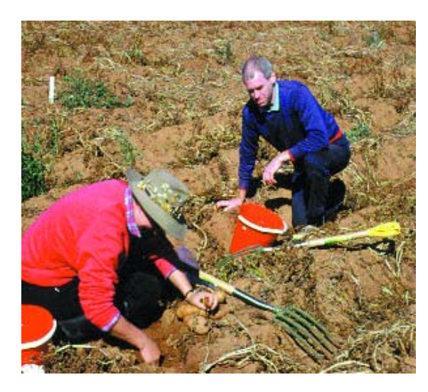
Figure 3. Sampling tubers for testing.

Sampling of plant tops to estimate cadmium concentrations in tubers is not recommended, as levels vary with different stages of crop growth.